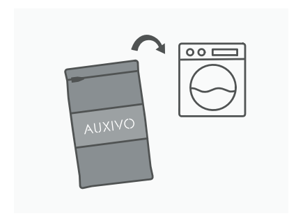
Close the release buckles and place the textile parts in a washing bag.