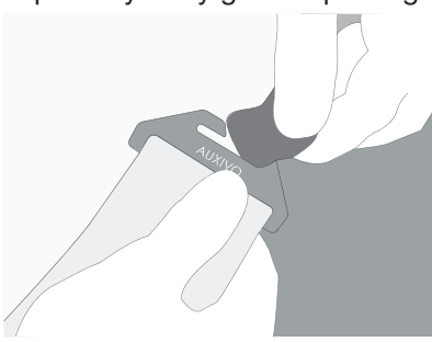
Then squeeze the loop onto the shorter side of the hook. Repeat the process for the lower connection and the other side.