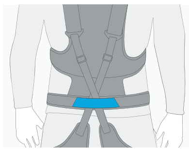
Make sure the connecting straps run through the tunnel in the hip belt.