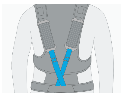
Take the strap from the opposite thigh cuff, so that the straps cross at the user's lower back.