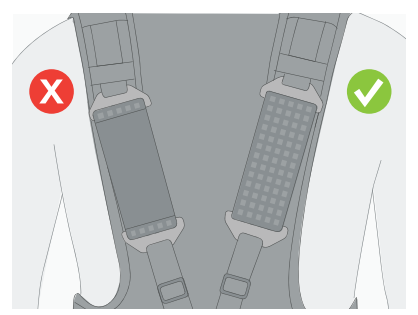
Make sure the black-white patterned side of the elastics are facing you.