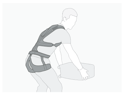
The LiftSuit is again ready to support you during work.