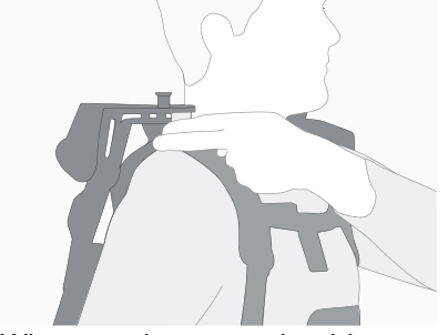
When gap between shoulder and exoskeleton is less than two fingers, tighten shoulder straps more (step 3).