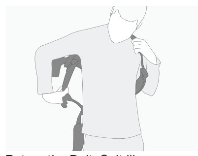
Put on the DeltaSuit like a backpack.