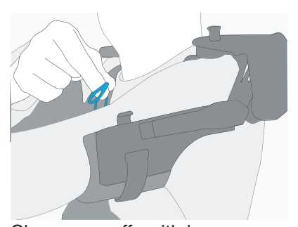
Close arm cuffs with loops.