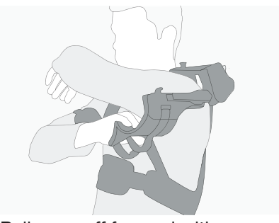
Pull arm cuff forward with opposite arm and place arm in arm cuff.