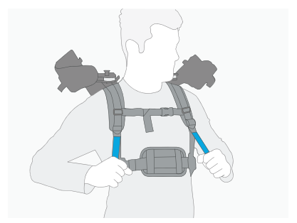
Tighten the shoulder straps to make sure the vest is worn high on the torso.