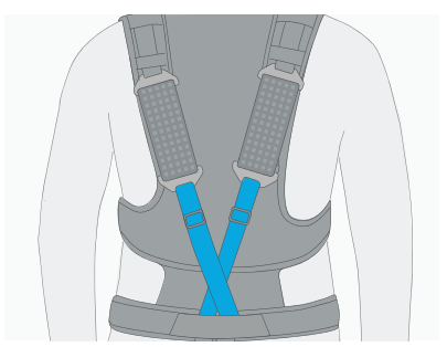
Take the strap from the opposite thigh cuff, so that the straps cross at the user's lower back.