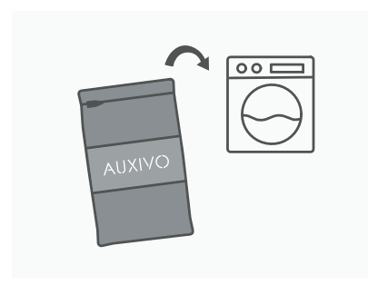
Close the release buckles and place the textile parts in a washing bag.