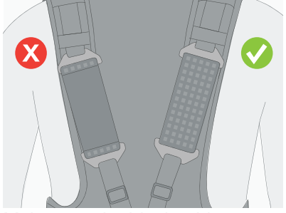
Make sure the black-white patterned side of the elastics are facing you.