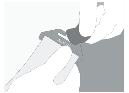
When the textile band slips out of the hook, pull it out. Repeat the process for the other connection.