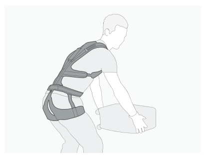
The LiftSuit is again ready to support you during work.